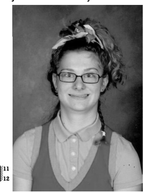
© 2019 CC BY-NC-SA Intl. 4.0 Robert Becker (St. Louis, MO)