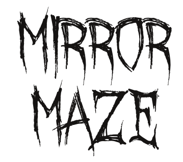
It is a foul bauble of man's vanity. Away with it! —Count Dracula

Only visit icons with perfect reflections, then take the first letter of each