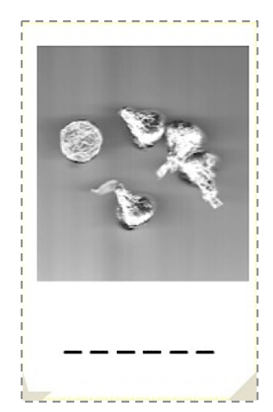
Cut out all 16 pieces!