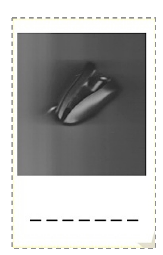
Cut out all 16 pieces!