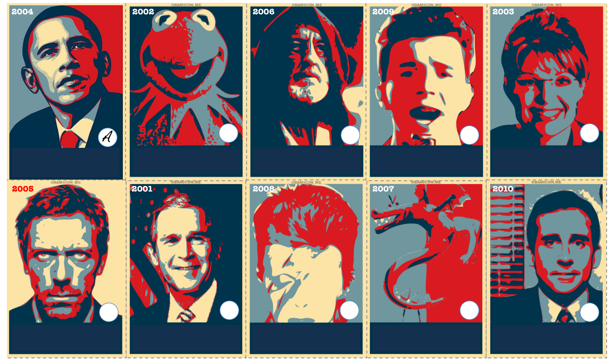
(cut out all posters along dashed lines)