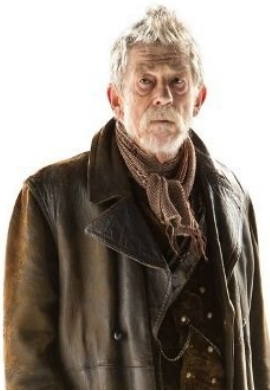
The War Doctor (John Hurt, 2013) Chronologically between the Eighth and Ninth Doctors, the War Doctor helped save Gallifrey during the Time War.