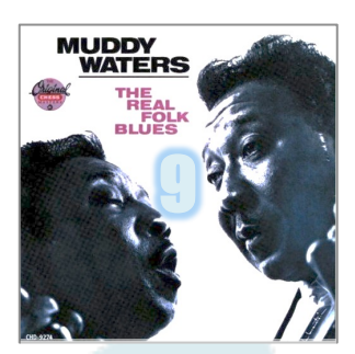
Rollin' and Tumblin'