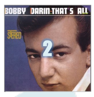
Beyond the Sea