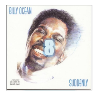
If I Should Lose You