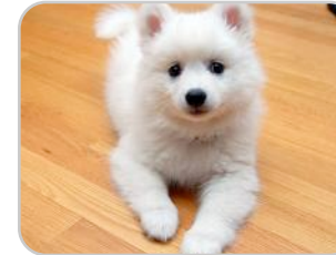
Noodle Age: 25

House Trained: N Spayed/Neutered: N Likes Cats: Y Likes Kids: N Very Active: Y