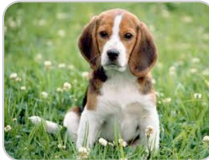
Sophie Age: 5

House Trained: Y Spayed/Neutered: Y Likes Cats: N Likes Kids: N Very Active: N