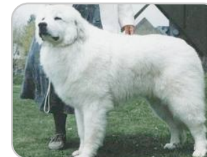
Ellie Age: 4

House Trained: N Spayed/Neutered: Y Likes Cats: Y Likes Kids: Y Very Active: N