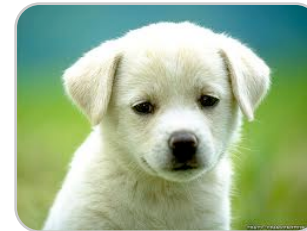
Phillip Age: 3

House Trained: N Spayed/Neutered: Y Likes Cats: N Likes Kids: Y Very Active: N