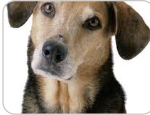
Happy Age: 9

House Trained: Y Spayed/Neutered: N Likes Cats: Y Likes Kids: Y Very Active: N