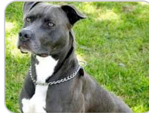
Riely Age: 9

House Trained: N Spayed/Neutered: N Likes Cats: N Likes Kids: N Very Active: Y