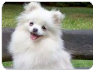
Yoda Age: 20

House Trained: Y Spayed/Neutered: N Likes Cats: N Likes Kids: N Very Active: Y