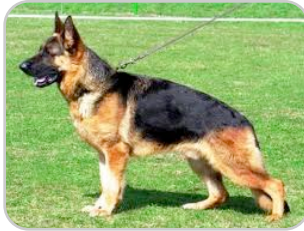
Tom Age: 2

If you need hints or more information visit http://puzzledpint.com .