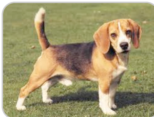
Earl Age: 13

House Trained: Y Spayed/Neutered: Y Likes Cats: Y Likes Kids: Y Very Active: Y