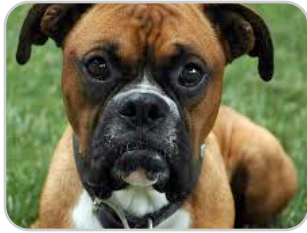
Terry Age: 20

House Trained: Y Spayed/Neutered: Y Likes Cats: N Likes Kids: Y Very Active: Y