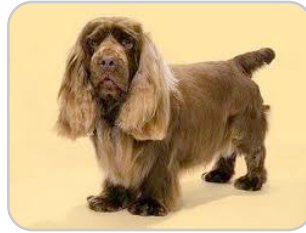
Gizmo Age: 8

House Trained: Y Spayed/Neutered: Y Likes Cats: N Likes Kids: Y Very Active: Y