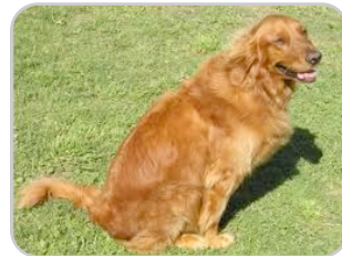
Larry Age: 15

House Trained: N Spayed/Neutered: N Likes Cats: Y Likes Kids: N Very Active: Y