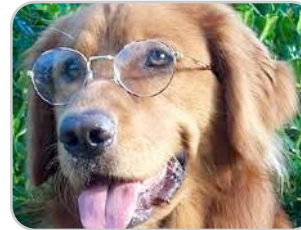
Ebony Age: 18

House Trained: Y Spayed/Neutered: N Likes Cats: Y Likes Kids: Y Very Active: Y