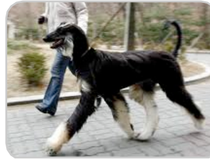
Alli Age: 3

House Trained: Y Spayed/Neutered: Y Likes Cats: N Likes Kids: Y Very Active: Y