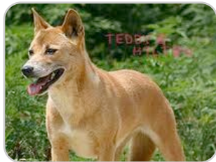
Eunice Age: 19

House Trained: N Spayed/Neutered: N Likes Cats: Y Likes Kids: N Very Active: Y