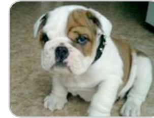
Echo Age: 14

House Trained: Y Spayed/Neutered: N Likes Cats: N Likes Kids: N Very Active: Y