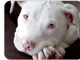
Uno Age: 12

House Trained: Y Spayed/Neutered: N Likes Cats: Y Likes Kids: Y Very Active: Y