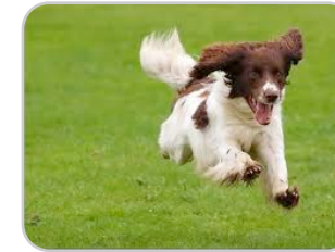
Gina Age: 5

House Trained: N Spayed/Neutered: N Likes Cats: N Likes Kids: Y Very Active: Y