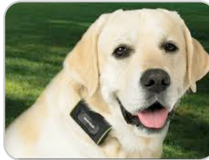
Sadie Age: 1

House Trained: Y Spayed/Neutered: N Likes Cats: N Likes Kids: N Very Active: Y