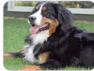
Ira Age: 14

House Trained: Y Spayed/Neutered: N Likes Cats: Y Likes Kids: Y Very Active: N