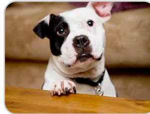
Mason Age: 15

House Trained: N Spayed/Neutered: N Likes Cats: Y Likes Kids: N Very Active: Y