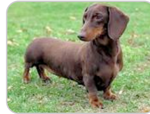
Nipper Age: 18

House Trained: N Spayed/Neutered: N Likes Cats: Y Likes Kids: N Very Active: N