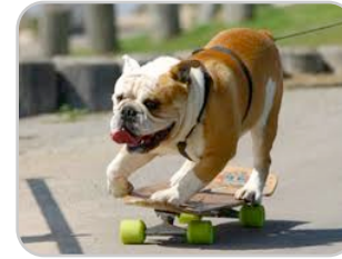
Ollie Age: 5

House Trained: N Spayed/Neutered: N Likes Cats: N Likes Kids: N Very Active: Y