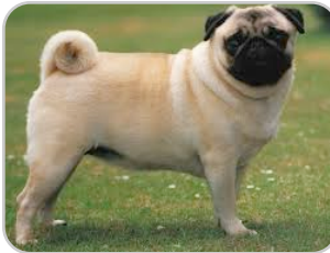
Amber Age: 20

House Trained: Y Spayed/Neutered: Y Likes Cats: N Likes Kids: Y Very Active: N