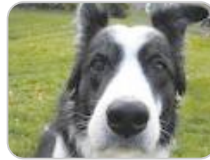
Opie Age: 4

House Trained: N Spayed/Neutered: N Likes Cats: Y Likes Kids: Y Very Active: N