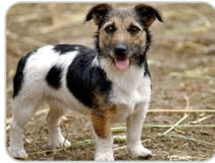
Tootsie Age: 1

House Trained: Y Spayed/Neutered: N Likes Cats: N Likes Kids: N Very Active: Y